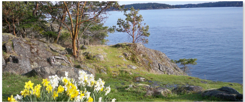
Daffodil Point in Burgoyne Bay is a favourite place to take in Spring.

Salt Spring Trail & Nature Club, PO Box 203, Salt Spring Island, BC, V8K 2V9