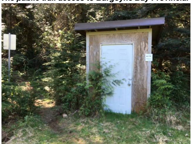
The trail goes by this shed. You must not turn

right as you pass the shed. Just continue straight ahead to the road shown below.