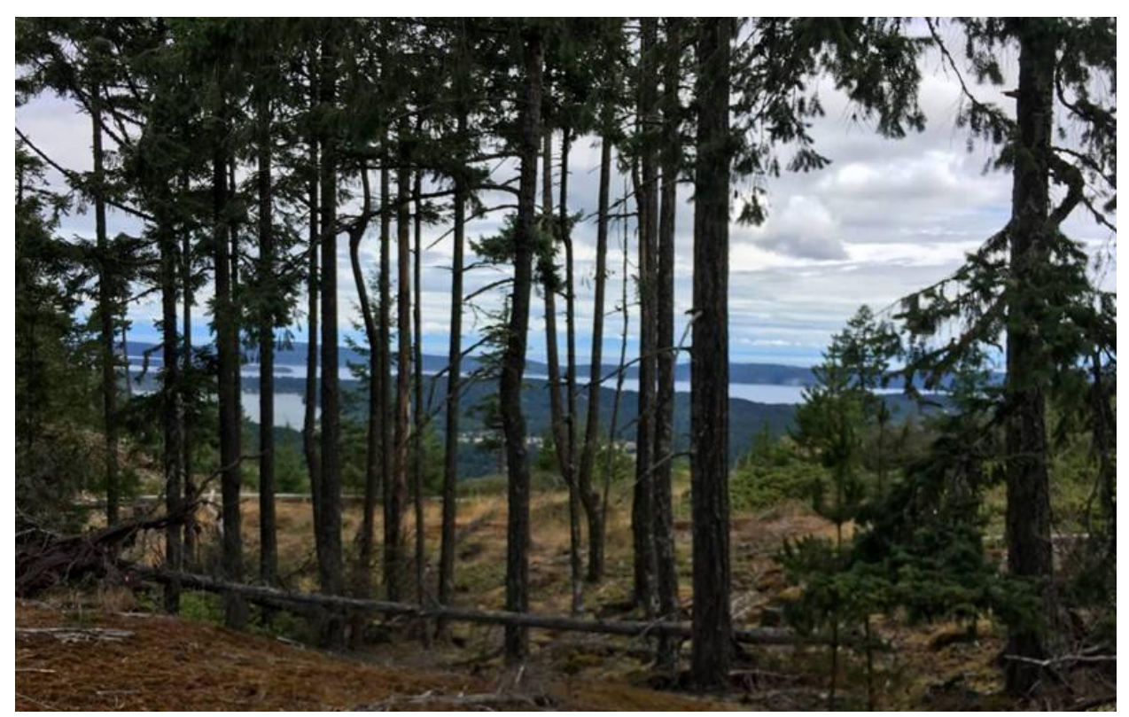
View from the trail looking east (top) and from the property border on the west (below)