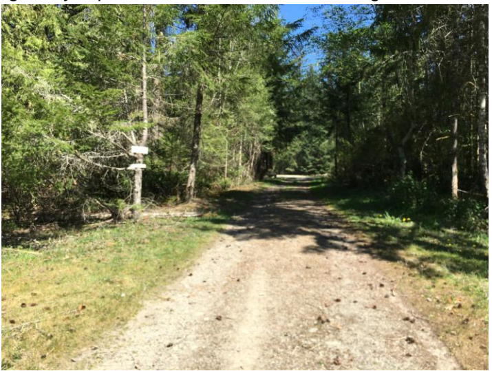
The CRD road between the CRD land and Burgoyne Bay Provincial Park. When using this access to the park, you must turn left at the field (indicated by the rough signage shown at the left in this photo). It's important not to approach the CRD liquid waste plant and the potentially dangerous trucks that use it.

right as you pass the shed. Just continue straight ahead to the road shown below.