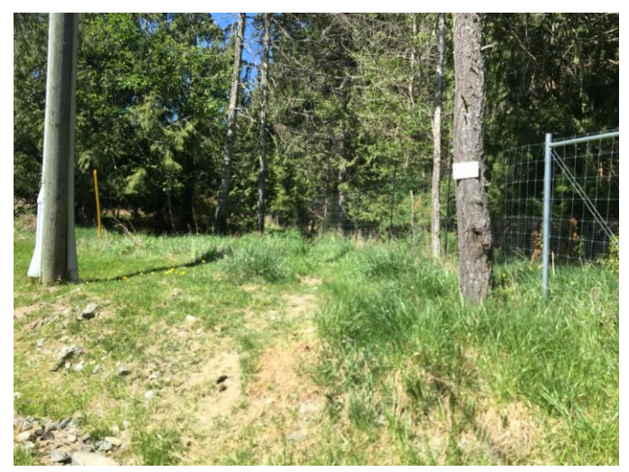
The public trail access to Burgoyne Bay Provincial Park from Ashya Road